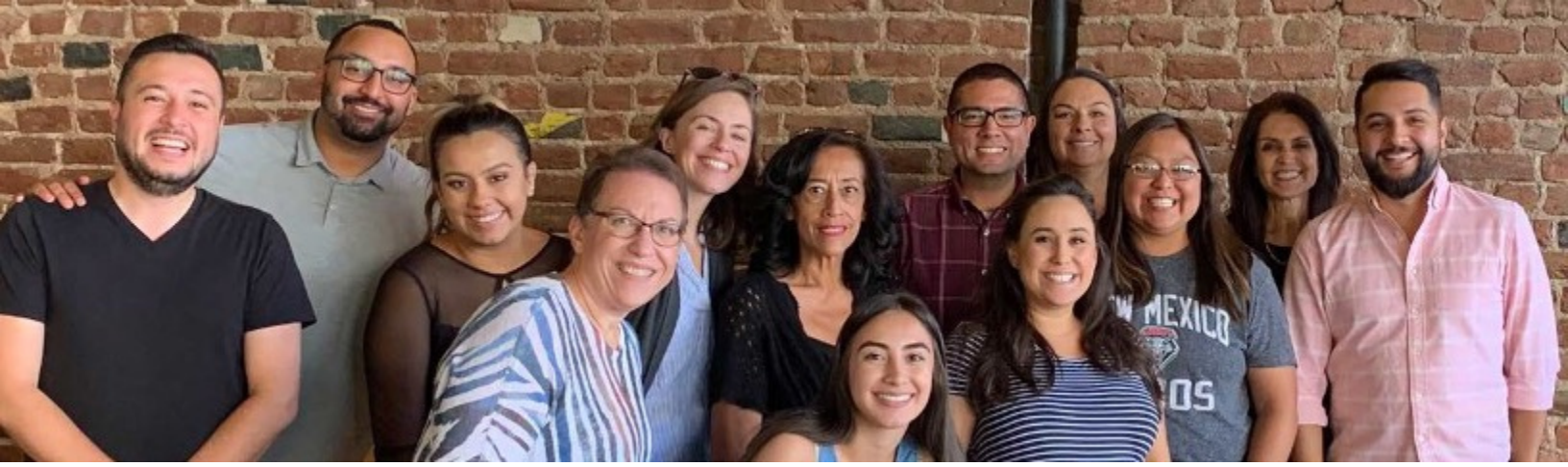
Health Sciences Office for Diversity, Equity & Inclusion