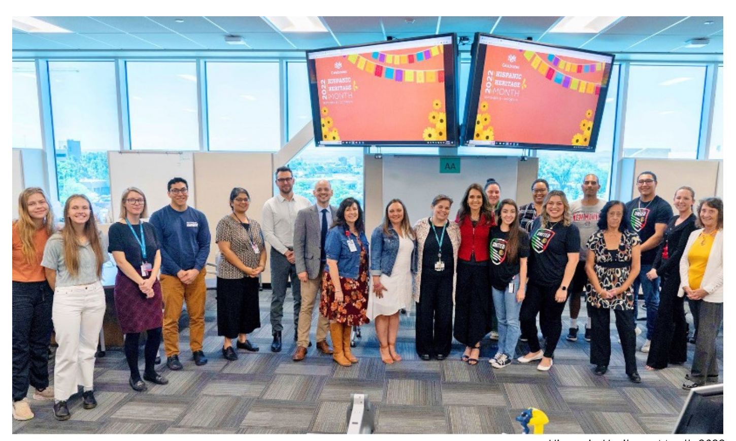
Hispanic Heritage Month 2022

Two initial activities of the IEC have included collaboration in heritage month planning and development of this DEI historical report. Most recently, the UNM Health Sciences Office for DEI is conducting an institutional climate assessment that is taking place in FY 2023.